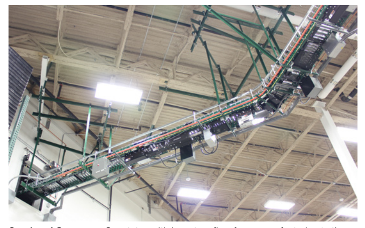
Overhead Conveyor: Gray totes with inventory flow from manufacturing to the assembly area via overhead accumulation conveyor.