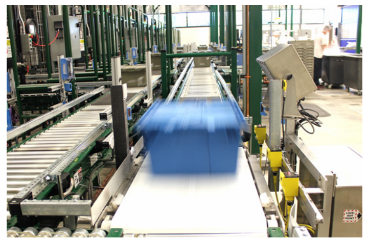
Storage: Conveyor transports totes back to Multishuttle.