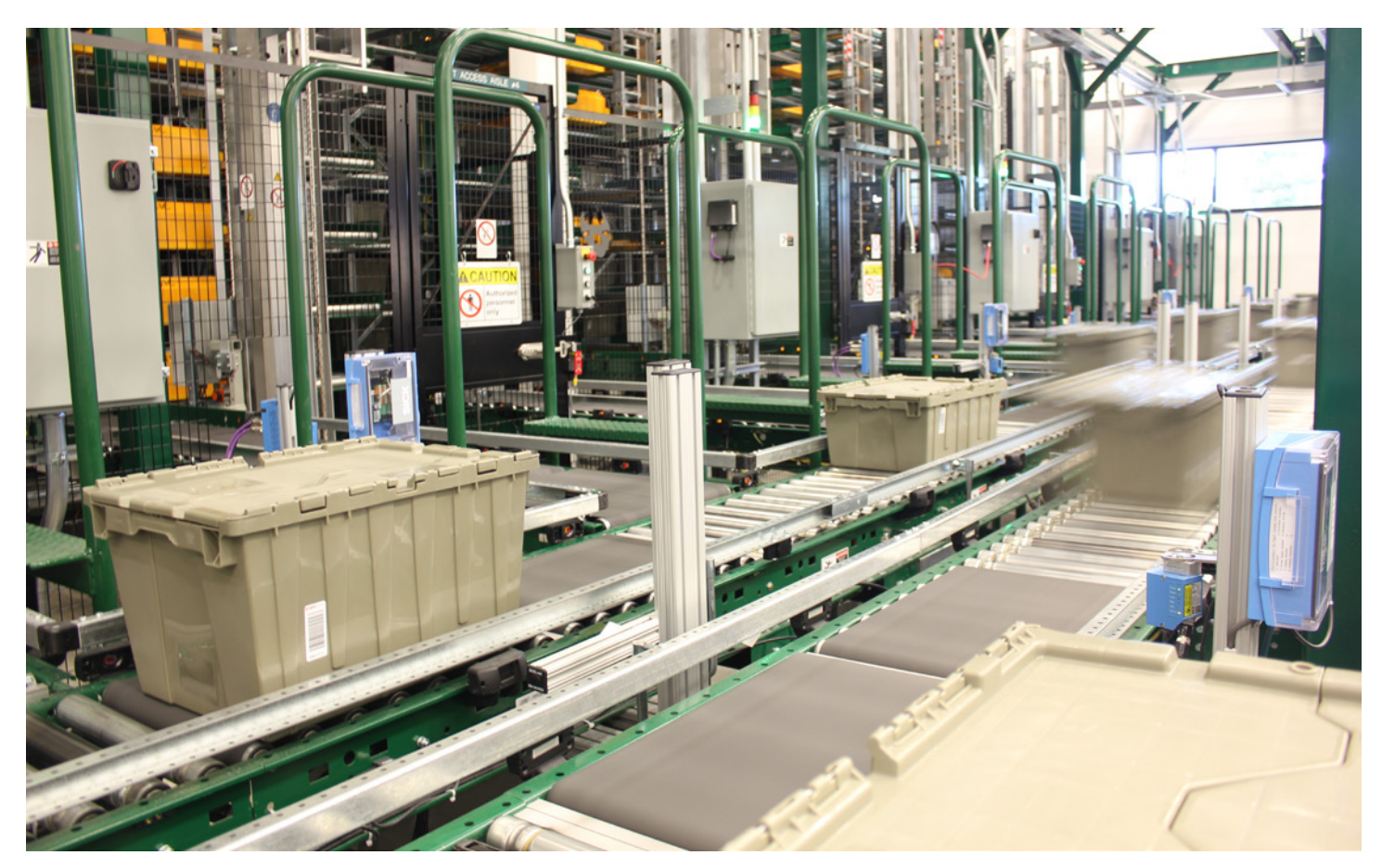
Multishuttle In/Out Conveyor Loop: Connects the Multishuttle to the workstations. Inventory totes are brought to and from workstations.

The workstations are where workers perform goods-to-person kitting. Workers interact with the Dematic software user interface to request totes of product, acknowledge inventory taken from totes, and send the totes back on the conveyor loop.