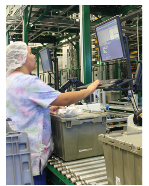
Workstation: Workers interact with Dematic software user interface to confirm assembly process.