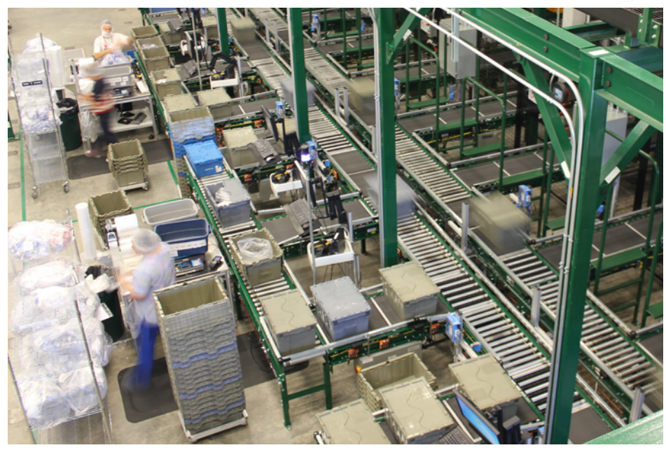
Workstations, Goods-to-Person Kitting: Workers assemble kits with inventory from the Multishuttle.