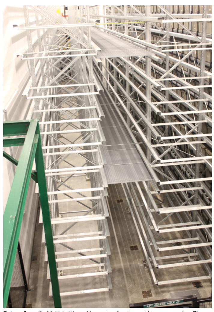
Future Growth: Multishuttle racking set up for planned future expansion. The modular design and scalability of the Dematic system allows capacity to be easily added.