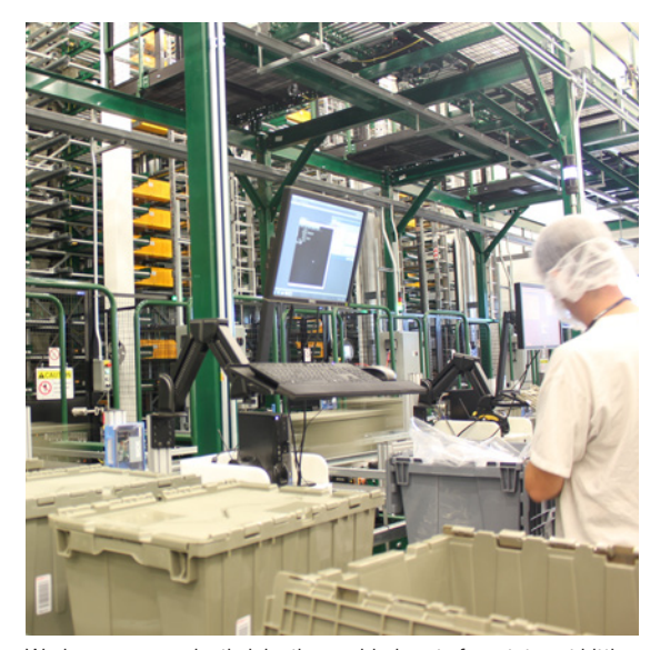
Workers remove plastic injection molded parts from totes at kitting workstation.

Merit Medical Systems, Inc. is a leading manufacturer of medical devices used in diagnostic and interventional cardiology and in radiology procedures. Successful products and growing sales presented the company with challenges at its manufacturing facility in Utah. Merit worked together with Dematic to develop an automated kitting solution that meets their specialized needs.