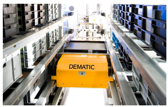
Multishuttle Work-in-Process Buffer: Inventory totes are stored in this Multishuttle sub-system until needed at assembly workstations.