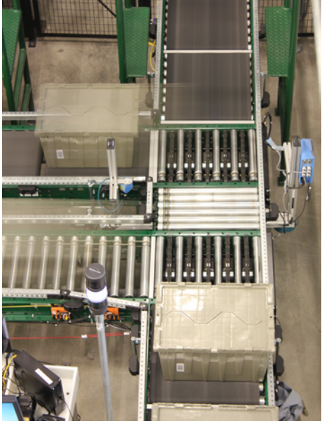
Right Angle Transfer: Diverts totes from the conveyor loop to individual workstations.