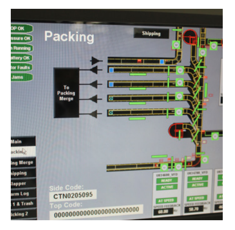
The Dematic Warehouse Control System (WCS) manages the flow of the order cartons

To support the Zone Route System pick method, a conveyor network is provided to control the flow of order cartons into and out of the zones. One worker is stationed in each zone; however additional workers could be added during peak periods. Or, during periods of lower order volume, one worker could traverse multiple zones.