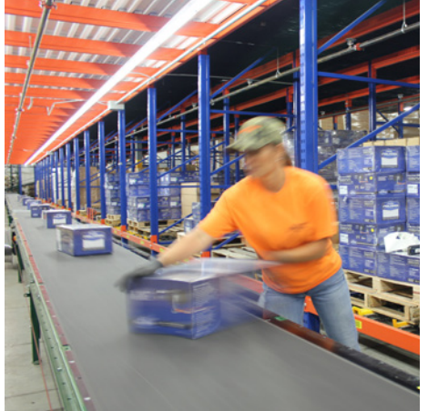
The system also accommodates case picking in a two level pick module

The picking staff is not required to circulate throughout the entire warehouse to locate inventory for picking. Instead, the system designs positions workers in pick zones where the inventory is arranged in a high density, compact configuration. This allows workers to walk less, and accomplish more picks per hour. In addition, the Zone Route System directs orders containers only to zones with picks, thereby reducing order processing time. The systemized approach, combined with convey and sort automation, brings discipline, process improvement and labor productivity to the pick, pack and ship process. In addition, the system is designed to accommodate growth; for example, diverters are pre-installed into the shipping layout. In the future, when additional capacity is required, modular down-line conveyor will be connected and the pre-configured software will be activated.